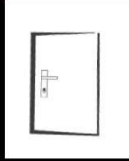
Plate Style Handle